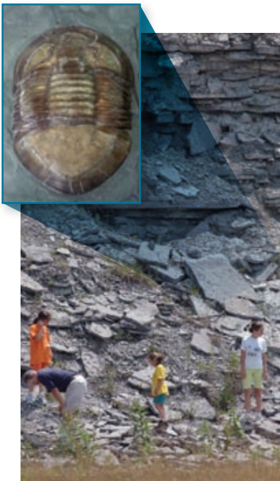
FIGURE 4.1 This trilobite, an early marine invertebrate that is now extinct, was found in this loose rock bed in Ohio. Although far from modern-day oceans, this site is actually the floor of an ancient sea.

Recall that during the Beagle expedition Darwin saw that island plants and animals looked like, but were not identical to, species on the South American continent. He extended this observation, proposing that island species most closely resemble species on the nearest mainland. He hypothesized that at some point in the past, some individuals from the South American mainland had migrated to the islands.