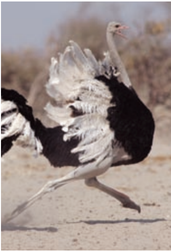
FIGURE 4.6 Vestigial structures, such as the wings of an ostrich, are organs or structures that are greatly reduced from the original ancestral form and have little or no current use.